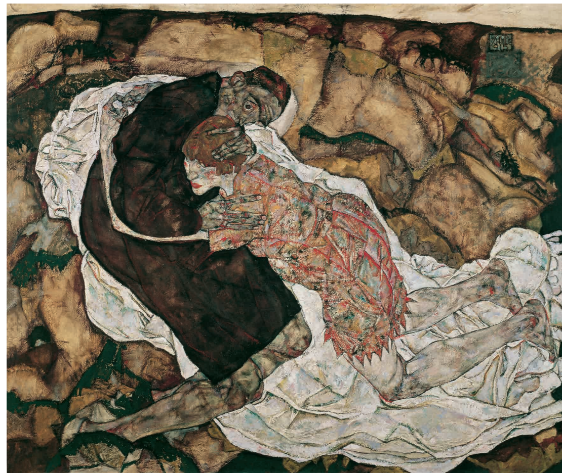
Egon Schiele Death and the Maiden, 1915 Oil on canvas 150 x 180 cm