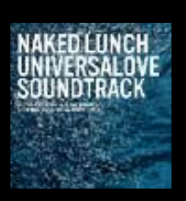
CD/Digital – LVR044 RELEASE DATE 24 / 04 / 2009

2007 Naked Lunch CD/LP - ,This Atom Heart of Ours'